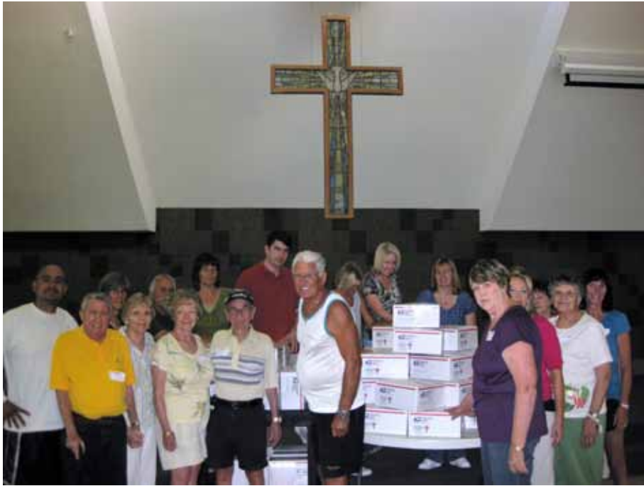
Hands and Hearts volunteers, along with the pastors and members of the church staff, pray over the August shipment of care packages.